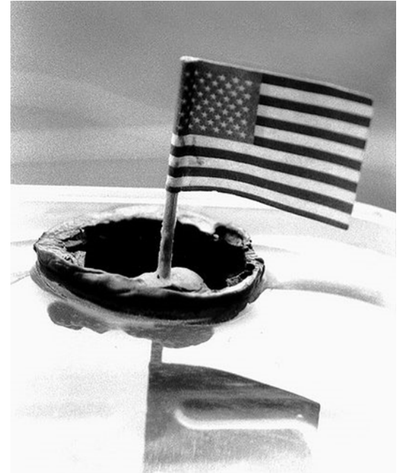
America in a Nutshell by Vermario